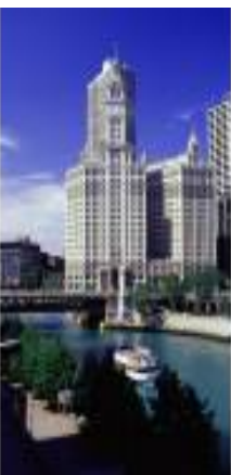
The Wrigley Building, Chicago