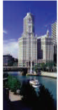
The Wrigley Building, Chicago