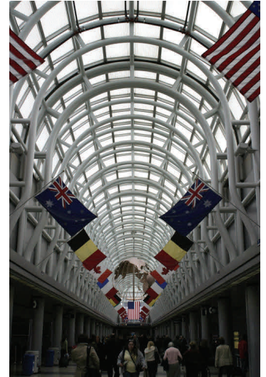
O'Hare Int'l Airport