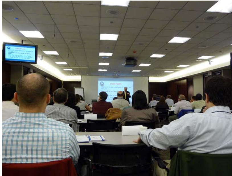
The Reid Interviewing and Interrogation Presentation

Thank you for your participation in this year's Chapter PDC! Many thanks to presenters and Chapter Directors who assisted in making it a success!